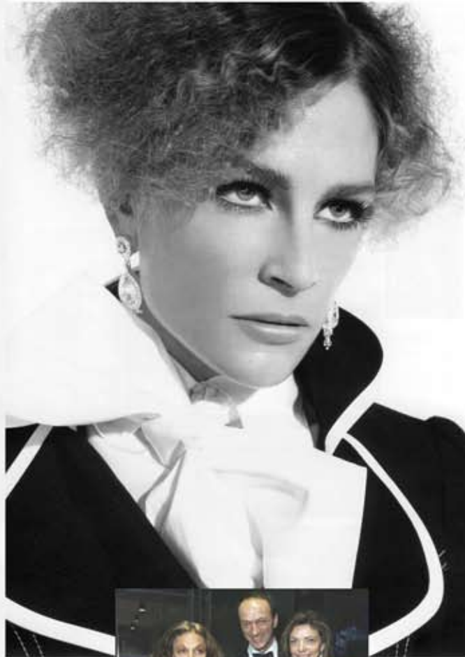
TARA SPENCER-NAIRN FROM "CORNER GAS" WEARING 6035E MONROE EARRINGS IN LUSH MAGAZINE - SPRING 2007