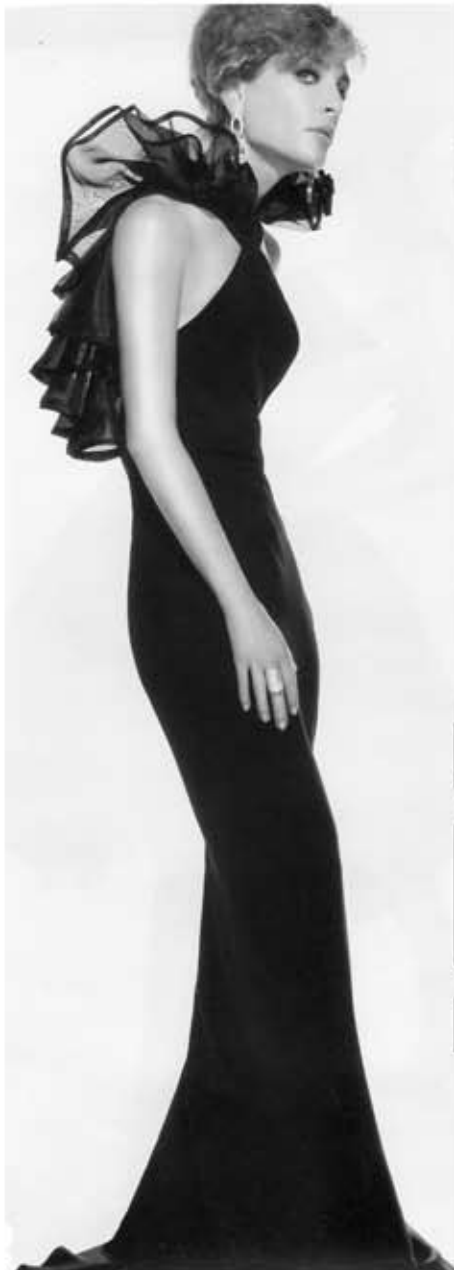
TARA SPENCER-NAIRN FROM "CORNER GAS" WEARING STILETTO EARRINGS IN LUSH MAGAZINE SPRING 2007