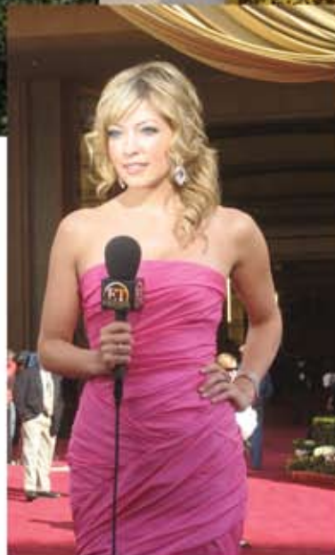
CHERYL HICKEY AT THE 2007 ACADEMY AWARDS WEARING 60318E STILETTO EARRINGS