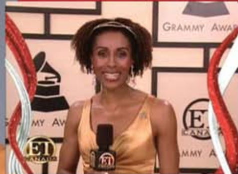
ROSEY EDEH WEARING 60402E BALI EARRINGS AT THE GRAMMY AWARDS 2008