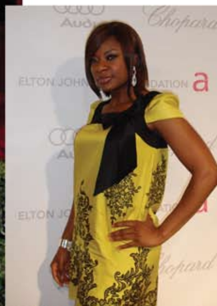
JULY BLACK WEARING 60318E STILETTO EARRINGS AND 60319B SHASTA BRACELET AT ELTON JOHN'S AIDS BENEFIT DURING THE 2007 OSCARS